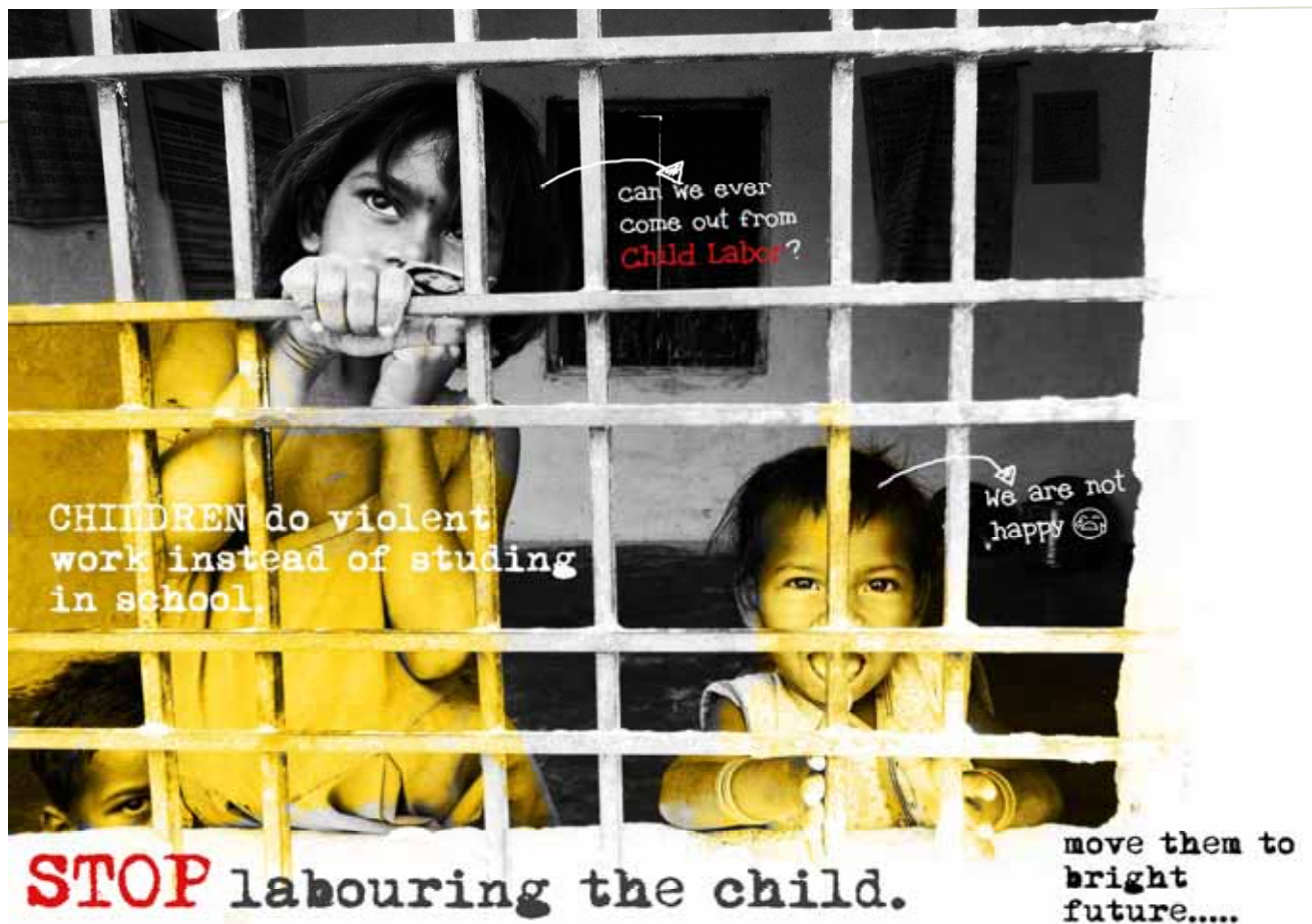
Cover page photo & designed by Manthan Charles