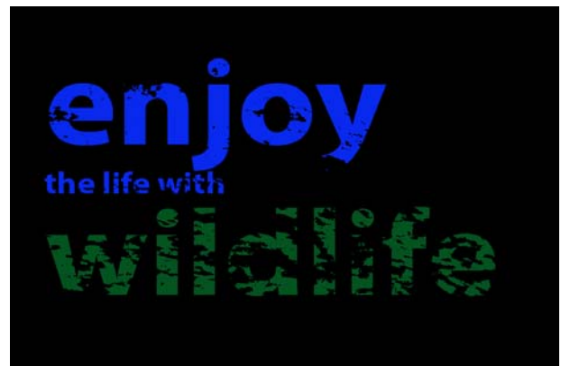
Posters Prepared by Youths during AYV training